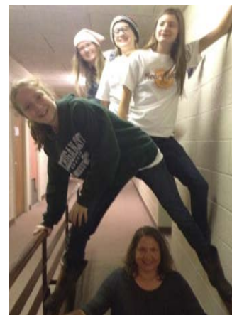
♥ We are Homeless